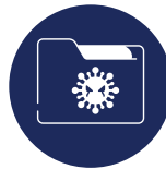
Advanced Persistent Threats (APTs)